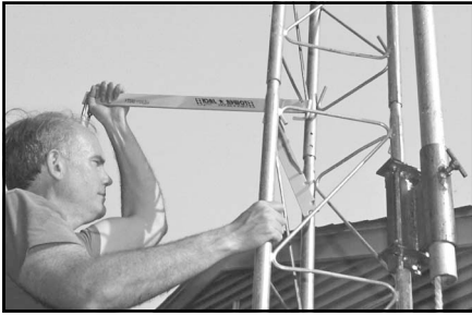
Figure 2—The Tower Jack provides the leverage needed to easily separate stubborn sections.