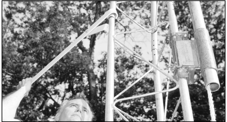
Figure 3—During tower assembly, you'll occasionally run into situations where some alignment adjustments are needed to get the third leg to insert. The Leg Aliner can provide the necessary force.